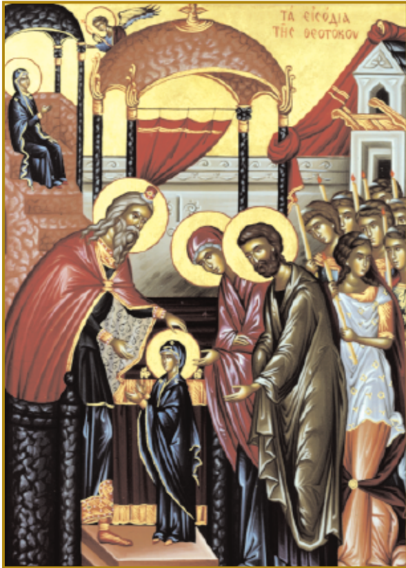
The Entry of the Mother of God into the Temple Troparion, Tone IV:

Today is the foreshadowing of the good pleasure of God, and the herald of the salvation of men. The Virgin is revealed in the Temple of God, and before the time she announces Christ to all. Let us therefore cry to her with mighty voice: Hail, thou fulfillment of the Creator's dispensation!